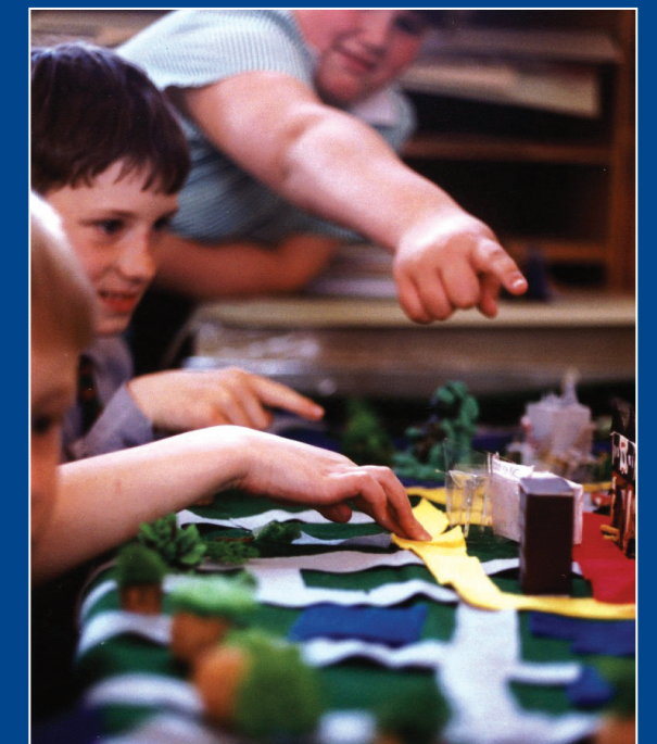
Children designing play spaces strategy

It is important to prepare and equip an event properly with 3-D props, ideally working to scale. However, never underestimate the ability of people to imagine a place in the future even if the vision is expressed by a model built with day-to-day items.