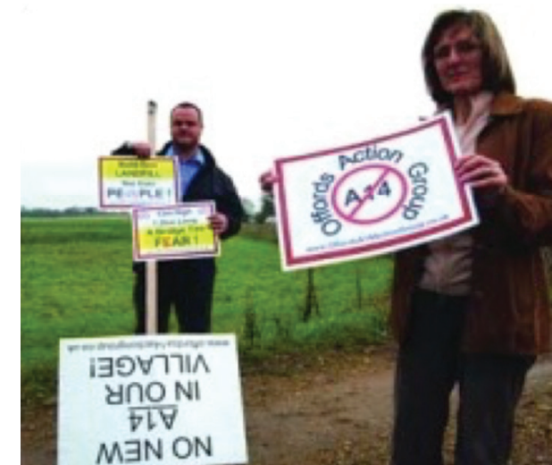
The threat of judicial review is increased when the adequacy of the consultation process is challenged

Provided this process is transparent, this is actually a sign of a healthy democracy. In the complex world we live in, no one is able to make the 'best' decisions on their own.