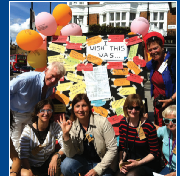
Interactive in situ 'I wish this was...' exercise for station area surrounds, Kentish Town Neighbourhood Plan

Setting up an interactive exhibition in a public street, square, supermarket and other public and semipublic places is an effective way to gather wishes and needs as well as engage in conversations with many more place users than is normally possible indoors. This method is particularly useful for public realm and development schemes, meeting people where they are while the site area is in sight. It also involves a wider range of groups, especially those who would perhaps not normally visit a formal exhibition or workshop.