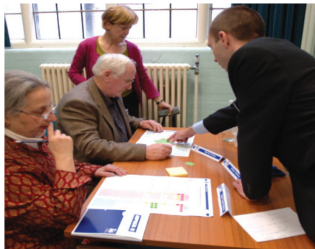
Oxford City Council Citizens' Panel indicating preferences for the council's budget allocation

Engagement methods and the extent of such a handover of decision-making power vary greatly nationally and globally. On one end of the scale, you might simply distribute 'project bespoke £ notes' at a workshop or citizens' panel asking participants to prioritise a list of developed public realm projects by pooling their individual budgets. The purpose of such a method is to gauge the nature of a collectively created list of priority projects.